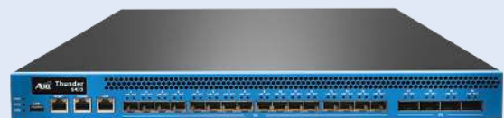
Thunder 6435(S) SPE