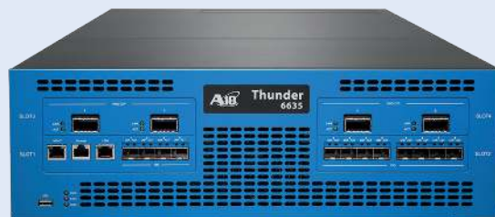
Thunder 6635(S) SPE